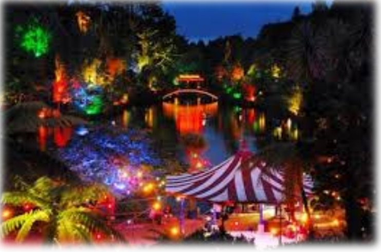
Festival of the Lights, Pukekura Park

Diversity is celebrated in New Plymouth District. It is a safe, welcoming and community-orientated place to live.